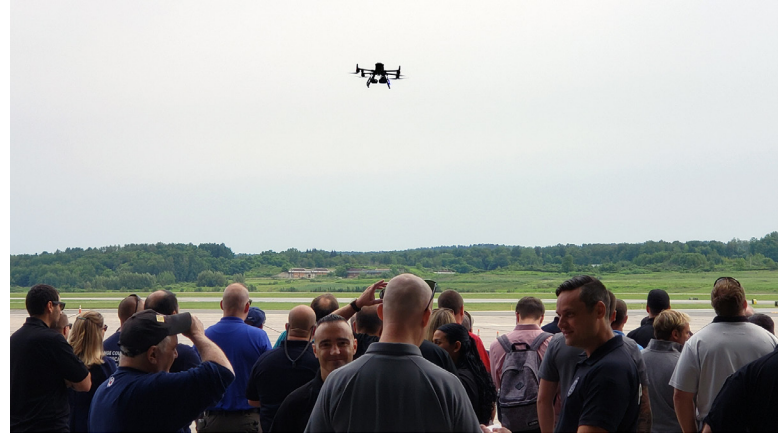
Participants witness a public safety drone operation at Griffiss International Airport.

Day One at the SPTC featured presentations from the Federal Aviation Administration (FAA) and NUAIR, which provided opportunities for learning and sharing best practices. The summit also included a panel discussion on Building