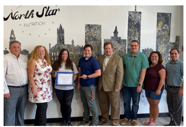
North Star Nutrition , located at 628 S. Main St, North Syracuse, celebrates its grand opening.