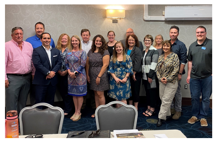
CenterState CEO Ambassadors gathered for the first in-person meeting since before the COVID-19 pandemic, in mid-July. Thank you to Holiday Inn of Liverpool, formerly Maplewood Suites Extended Stay, for the hospitality.