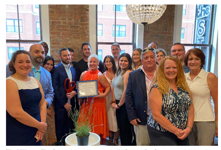
The Villas at The Stoop , located at 309-311 W. Fayette St., Syracuse, celebrates its grand opening.