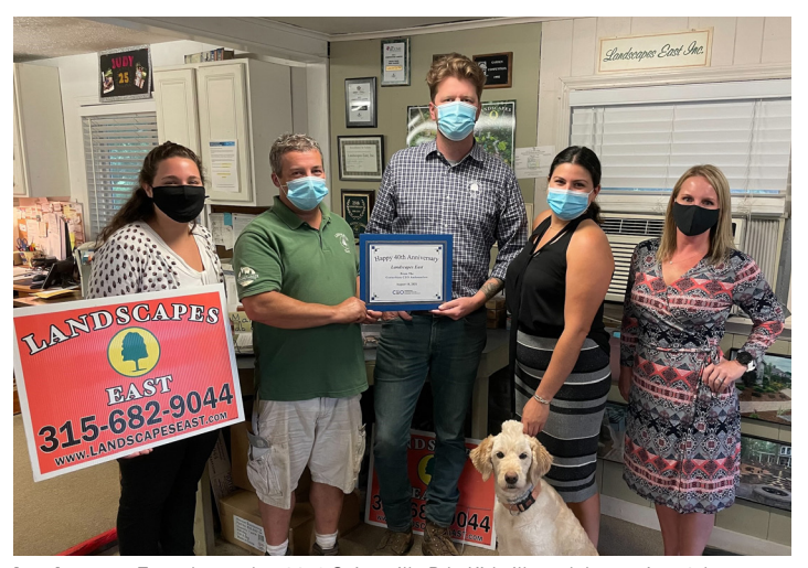
Landscapes East , located at 8012 Saintsville Rd., Kirkville, celebrates its 40th anniversary.