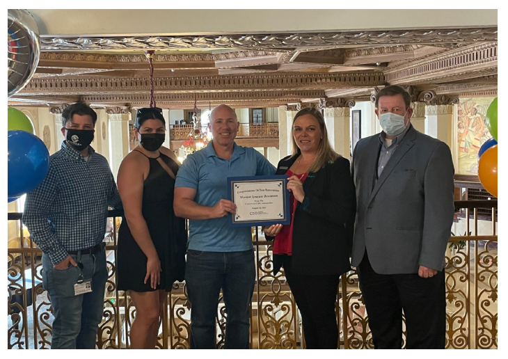
Marriott Syracuse Downtown , located at 100 E. Onondaga St., Syracuse, celebrates its guestroom renovations, new management and fifth anniversary.