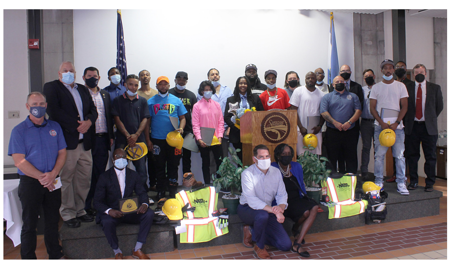
Stakeholders and supporters celebrate the first Pathways to Apprenticeship graduating class.

several community partners recognizing the need to prepare the local workforce, including the City of Syracuse, Greater Syracuse HOPE, Empire State Poverty Reduction Initiative, North America's Building Trade Unions, Central New York Community Foundation, United Way of Central New York and the Alliance for Economic Inclusion.