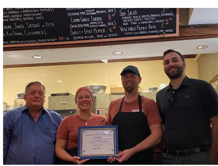
DAYBIRD, located at 250 S. Clinton St., Syracuse, celebrates its grand opening.