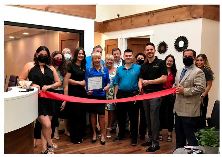
Syracuse Wealth Management, LLC , located at 8138 Soule Road, Liverpool, celebrates its newest location's grand opening.