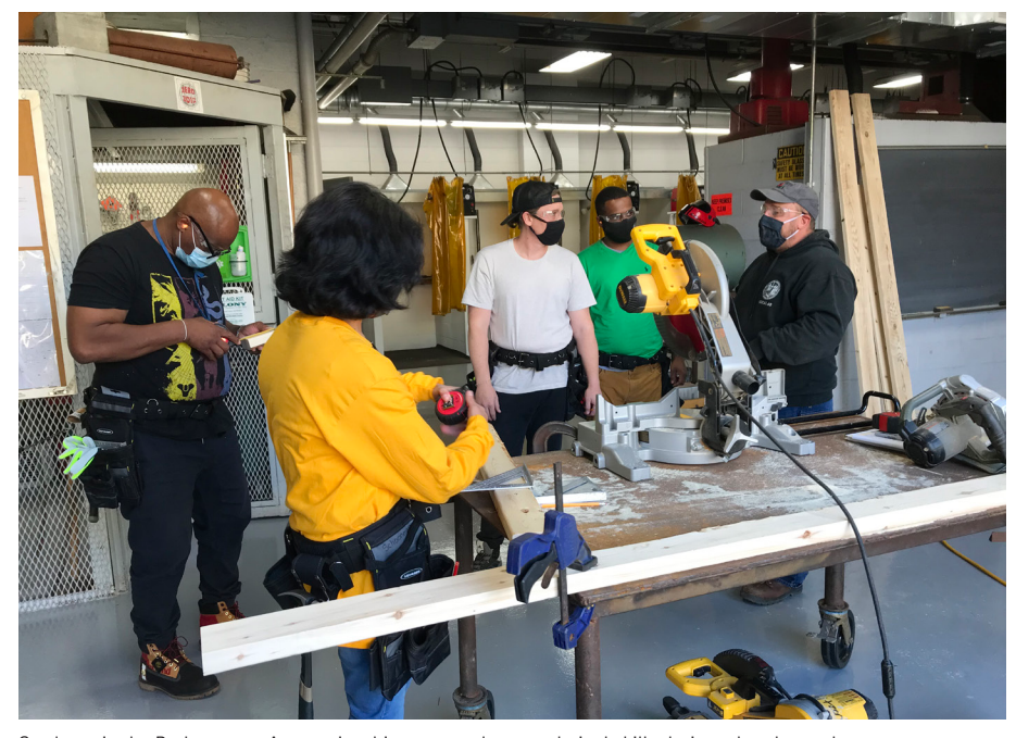
Students in the Pathways to Apprenticeship program learn technical skills during a hands-on class.

Funding for the Pathways program comes from