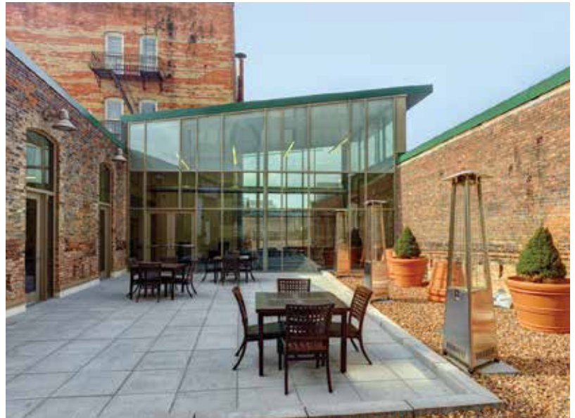
The Pike Block – a collection of four historic buildings in the heart of downtown Syracuse – was transformed by VIP Structures for retail, business and residential use. Pictured above is the 4th floor rooftop patio atop the Witherill Building.