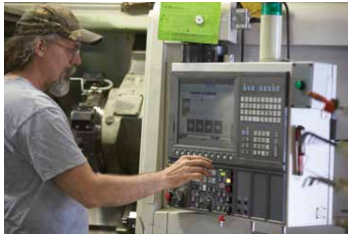
An employee on the line at Darco Manufacturing, Inc., in Syracuse, host of the Manufacturing Careers Partnership press announcement.