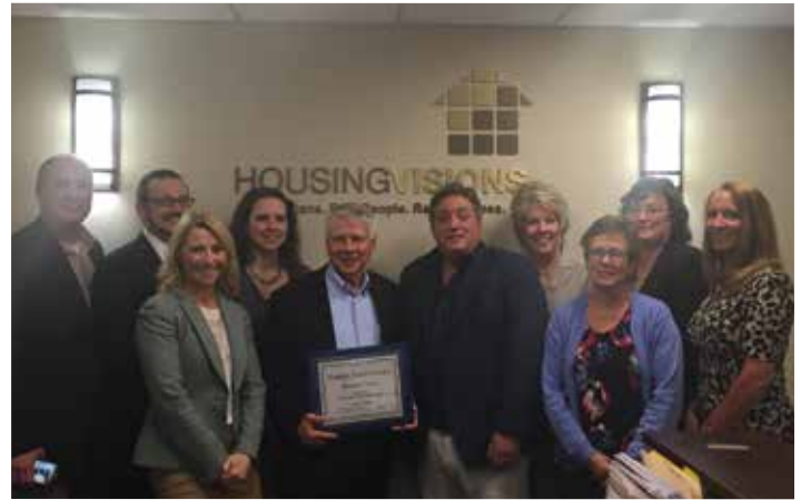
Housing Visions , 1201 E. Fayette St., Syracuse, celebrates its 25 th anniversary.