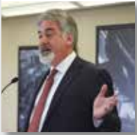
Local Partnership Creates Job Opportunities with Manufacturing Pre-apprenticeship Program