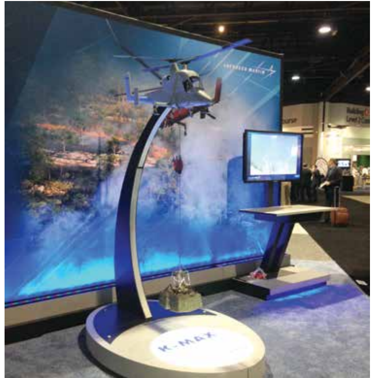
A model of Lockheed Martin's K-MAX, an unmanned cargo helicopter, at AUVSI's Unmanned Systems Trade Show in Atlanta.

The tradeshow included panel discussions addressing current issues in the unmanned aircraft industry, noting that in just a decade, incident-free technology will make drones commonplace in the air. NUAIR partner and CenterState CEO member Lockheed Martin displayed its K-MAX unmanned helicopter and the Indago UAS. Flyterra, a UAS software company, also exhibited its capabilities at the Griffiss NUAIR Alliance booth. New to the team this year was Avwatch, a Service-Disabled Veteran Small Owned Business, which focuses on homeland security and disaster recovery.