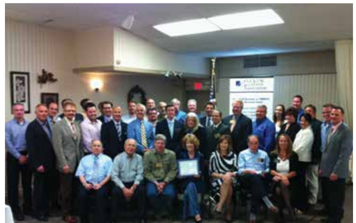
Syracuse Executive Association celebrates its 40th anniversary at the Bella Domani restaurant.