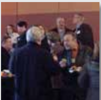
CenterState CEO Events