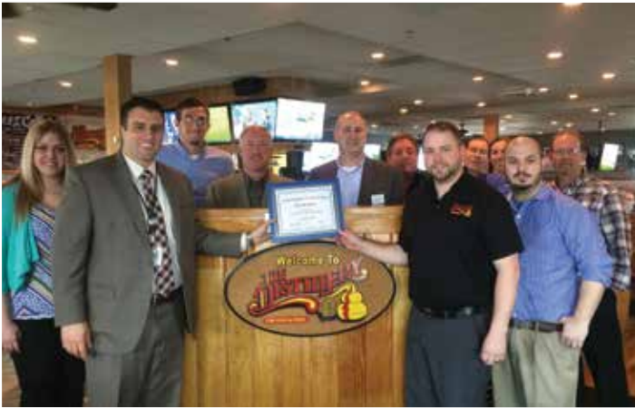
The Distillery restaurant, 3112 Erie Blvd. E., celebrates its grand opening.