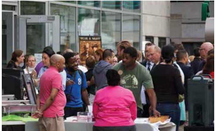
Attendees enjoy local refreshments and connecting with tech startups during last year's Tech Meets Taste at The Tech Garden.