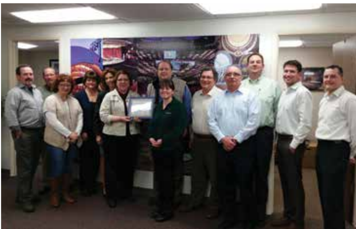
The staff at J.R. Clancy , 7041 Interstate Island Road in Syracuse, celebrates the company's remarkable 130 th anniversary.