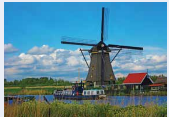
Kinderdijk Windmills, Holland

CenterState CEO invites travelers on a seven-night Springtime Tulip River Cruise featuring Dutch and Belgian Waterways, April 6 to 14, 2016 . Highlights include Amsterdam, Volendam, Arnhem, Middelburg, Ghent, Bruges, Antwerp, Kinderdijk Windmills and Keukenhof Gardens. River cruise tours feature small, intimate vessels for personal experiences as you travel the waterways. Trip includes round-trip airfare from Syracuse Hancock International Airport, seven-night cruise, and 20 meals: seven breakfasts, six lunches and seven dinners. Per person rates are: lower outside double $4,199; middle outside double $4,449; upper outside double $4,699; suite double $4,999. Book now and save $200 per person. For additional information, contact Shannon Fults at 315-470-1884 or sfults@centerstateceo.com