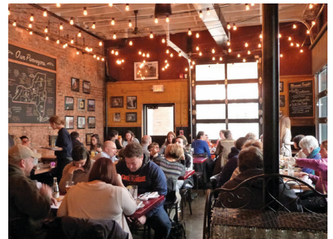
Dining Weeks draws an estimated 50,000 diners from across Central New York every winter. This is the 16th annual “serving” of the tradition.

Social Media Contest: While dining, patrons are encouraged to look for the return of the Downtown Committee’s “Spot the Chef’s Hat” contest. Each participating restaurant has hidden a chef’s hat somewhere in their dining area(s). When customers see it, they may take a picture of it and email the image – or a thorough description of the hat’s placement – to mail@downtownsyracuse.com . Correct guesses will be entered into drawings held during Downtown Dining Weeks for a restaurant gift certificate.