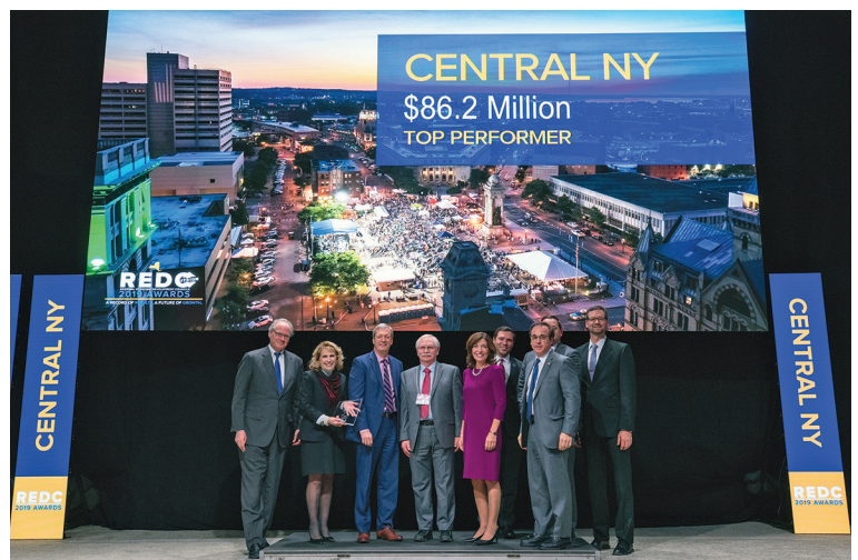
Members and supporters of the CNY Regional Economic Development Council celebrate winning $86.2 million to fund 93 projects.

To read a full list of CNYREDC projects selected in Round 9, visit https://on.ny.gov/35SDkaR .