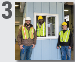
CEO's Work Train Team Helps Guide Syracuse Build

Download the 2020 Economic Forecast Report at: www.centerstateceo.com/Economic-Forecast-Report