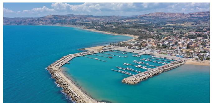
Travelers will enjoy stunning views and historic sites in Sicily and Malta.

CenterState CEO journeys to Sicily and Malta from October 31 to November 12, 2020. Highlights include Palermo, Cefalu, a farm visit, Erice, Agrigento, Taormina, Siracusa, Tas-Sliema, Medina and Valletta. This trip includes roundtrip air from Syracuse Hancock International Airport, air taxes and fees, hotel transfers and 18 meals. Per person rates if booked by May 1, 2020: double $4,549; single $5,149; triple $4,499. Contact Jennine Lombardi at 315-701-2648 or jlombardi@nyaaa.com to reserve your spot.