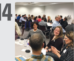
CenterState CEO Events