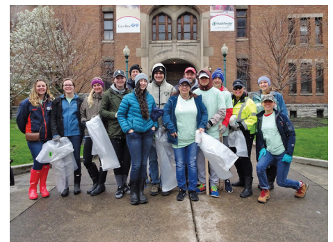
In 2018, 275 volunteers delivered more than 550 volunteer hours of community service to pick up litter throughout downtown Syracuse.