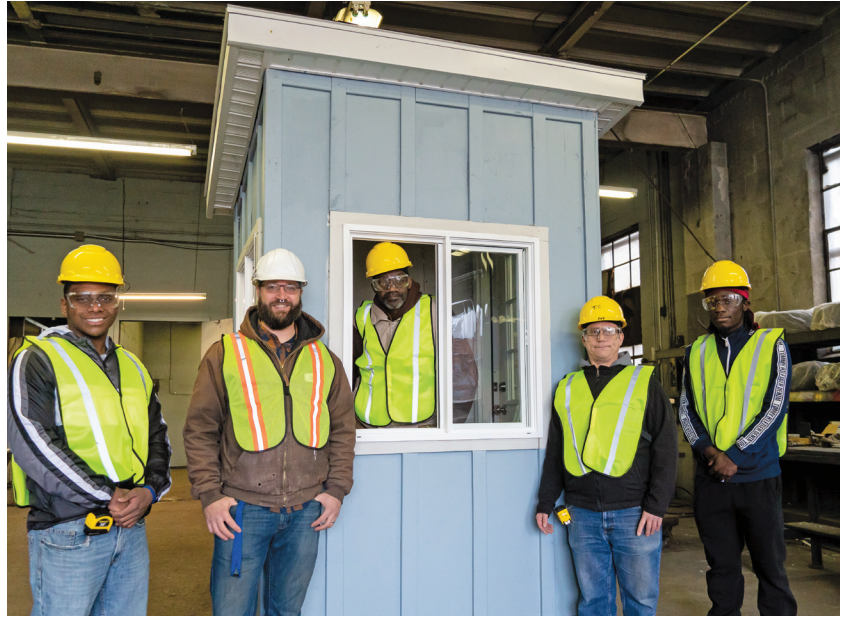
Build Ready students construct a guard shack at training partner SUNY EOC's campus.