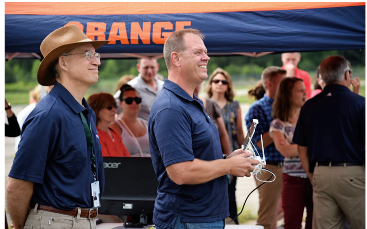
NUAIR continues to help public and private organizations learn how drones can help their work.