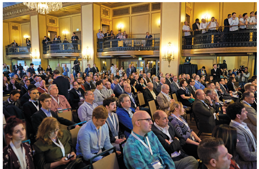
It was standing room only at GENIUS NY Finals Night 2019 at the Marriott Syracuse Downtown.

Since 2013 GENIUS NY has invested $9 million in 17 startups. The accelerator is based in Syracuse and is a short drive to the New York UAS Test Site managed by NUAIR, one of only seven in the nation.