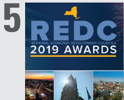
CNY Regional Council Receives $86.2 Million Award