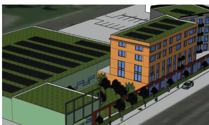
Access Dental is part of the planned Salina 1st mixed-use development project on Syracuse’s South Side.