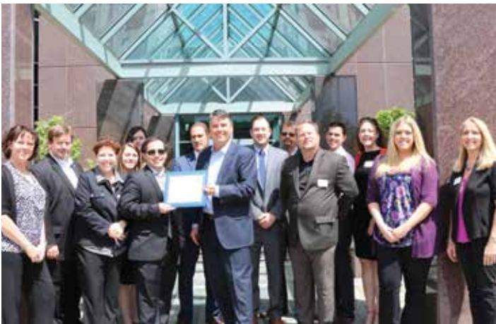
Haylor, Freyer & Coon, Inc. , 231 Salina Meadows Parkway in Syracuse, celebrates its 90th anniversary.