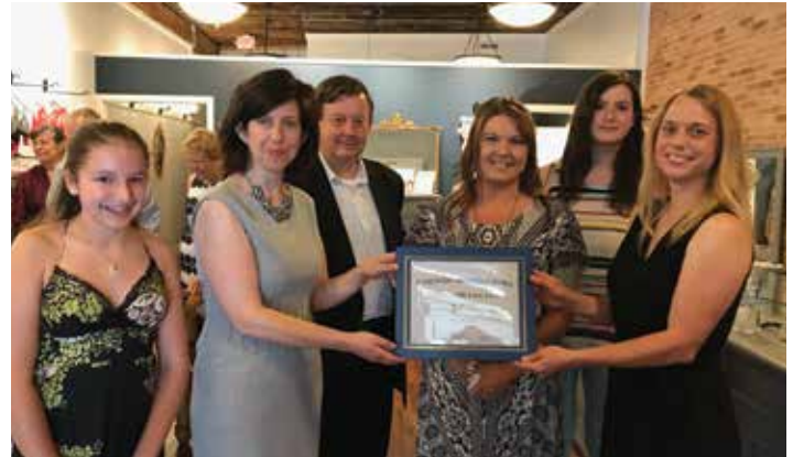
Fierce...with Love, LLC , celebrates its grand opening at 8914 N. Seneca St., Weedsport.