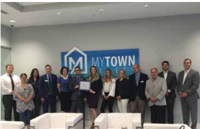
MyTown Realty opens at 344 S. Warren St., Suite 202 in Syracuse.