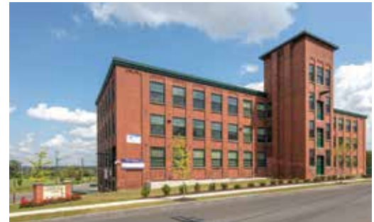
Harbor Street Lofts, a 40-unit mixed income historic project in Tipperary Hill.

This feature of CEO Essentials spotlights local companies that are "Economic Champions" because of their success in adding jobs, expanding their products or services, gaining national recognition or contributing to the success of the region in special ways.