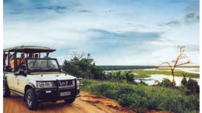
The spectacular South Africa trip includes a safari game drive like the one above.

Join CenterState CEO on a trip to spectacular South Africa, February 21 to March 5, 2019. Highlights include Johannesburg, Soweto, Kruger National Park, a safari game drive, Knysna, Featherbed Nature Reserve, an ostrich farm visit, winery lunch and tasting, Cape Town, Table Mountain and more! Per person rates, if booked by August 22, 2018, are: $4,999 (double) and $5,649 (single). Prices include 21 meals, round-trip air from Syracuse Hancock International Airport, air taxes and fees/surcharges and hotel transfers. Optional post-tour extensions available. AAA members receive an additional $50 off per person. For more information, contact Jennine Lombardi at 315-701-2648 or jlombardi@nyaaa.com .