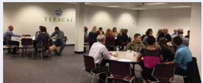
Nearly 50 people attended a recent speed networking event at TERACAI in North Syracuse.

See the events calendar on page 22 for upcoming opportunities to learn from fellow members and improve your business.