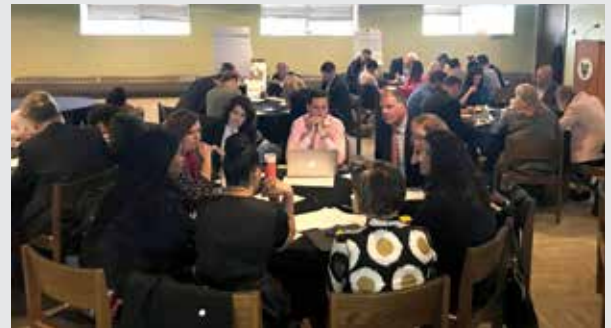
Business and community leaders work together at Le Moyne College to identify strategies to address talent challenges in Central New York.

More than 50 business leaders gathered last month to participate in a strategic planning session to create innovative solutions for the region's talent challenges. The event kicked off the second phase of the Talent Task Force, a regional initiative led by the private sector that includes the CNY Regional Economic Development Council, CenterState CEO and the NYS Department of Labor.