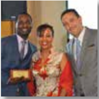
Upstate Minority Economic Alliance Celebrates Community Engagement Award Honorees

More than 50 business leaders gathered last month to participate in a strategic planning session to create innovative solutions for the region's talent challenges. The event kicked off the second phase of the Talent Task Force, a regional initiative led by the private sector that includes the CNY Regional Economic Development Council, CenterState CEO and the NYS Department of Labor.