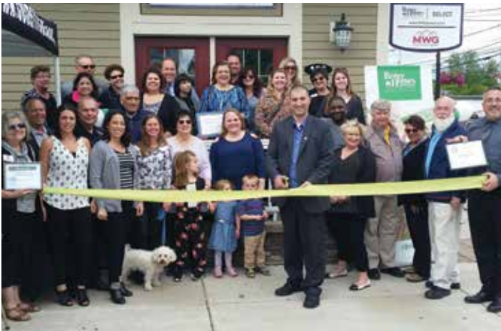
Better Homes & Gardens Real Estate Select staff cut the ribbon at 106 S. Main St. in North Syracuse.