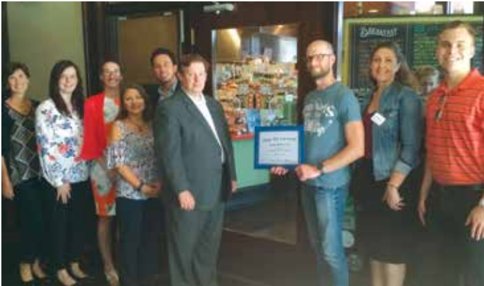
Strong Hearts Café , 719 E. Genesee St., in Syracuse, celebrates its 10th anniversary.