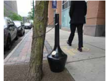
One of the new cigarette receptacles in front of The Galleries entrance, fronting South Warren Street.

The Downtown Committee of Syracuse is one of 42 organizations to receive grant funding through the 2018 Cigarette Litter Prevention Program. The program, now in its 16th year, is the largest in the nation aimed at reducing cigarette litter. In the communities where it has been implemented, it has reduced the amount of cigarette litter by an average of 50 percent. According to the Keep America Beautiful program, cigarette butts are the most-littered item in the country, and account for about one-third of the litter found at storm drains.