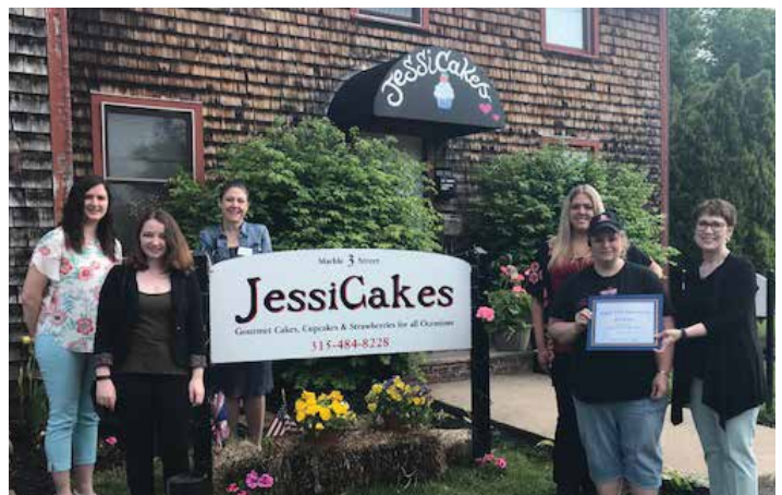
JessiCakes , located at 3 Marble St. in Baldwinsville celebrates its first anniversary.