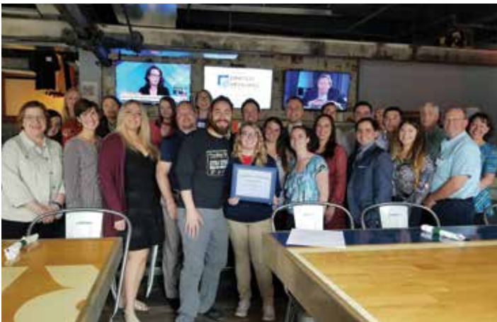
The PressRoom Pub is now open at 220 Herald Place, Syracuse.