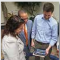
CenterState CEO Events