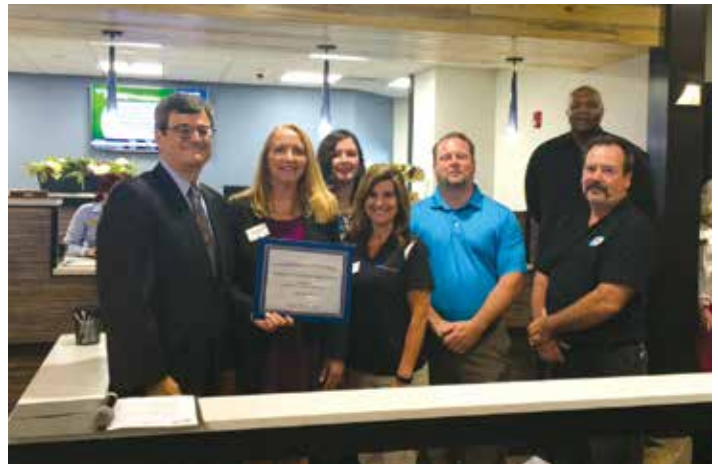
Empower Federal Credit Union opens a new branch at 900 Kinne St. in East Syracuse.