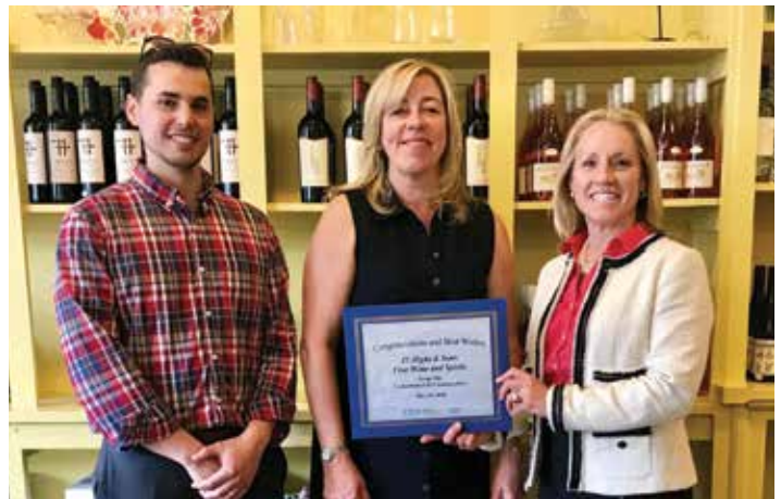
JS Hight & Sons Fine Wines & Spirits , located at 58 Albany St. in Cazenovia, celebrates its third anniversary.