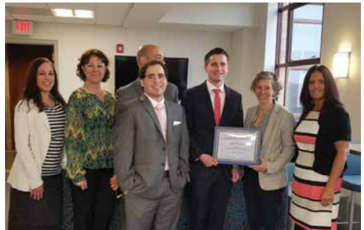
CenterState CEO Ambassadors celebrate the redevelopment of the State Tower building at 109 S. Warren St., Syracuse.