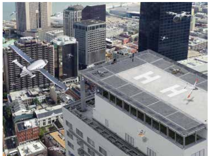
Urban air mobility means a safe and efficient system for vehicles, piloted or not, to move passengers and cargo within a city.