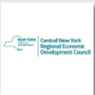
CNY Regional Council Seeks Catalytic Projects for Round eight of REDC Funding